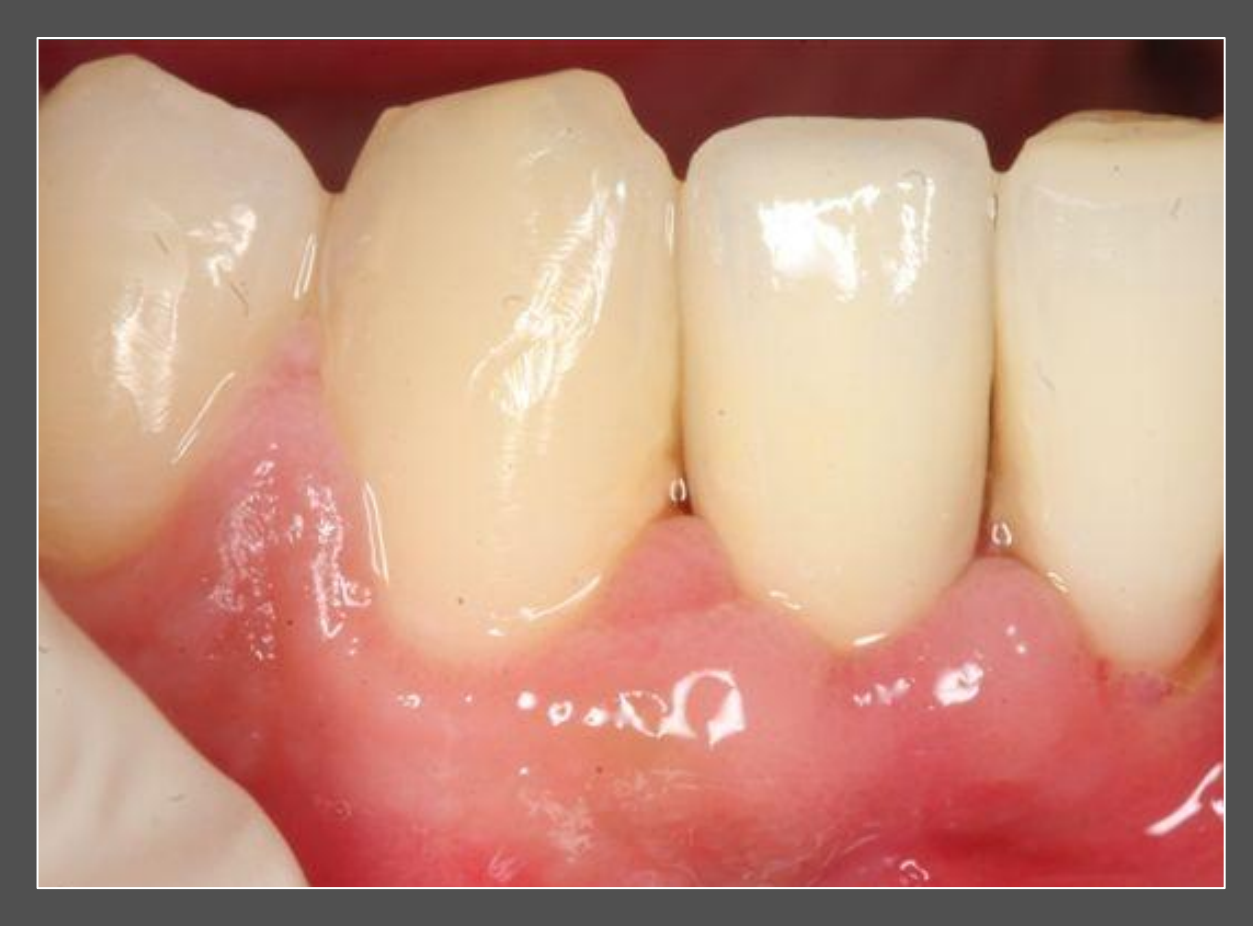
Definite restoration in place.