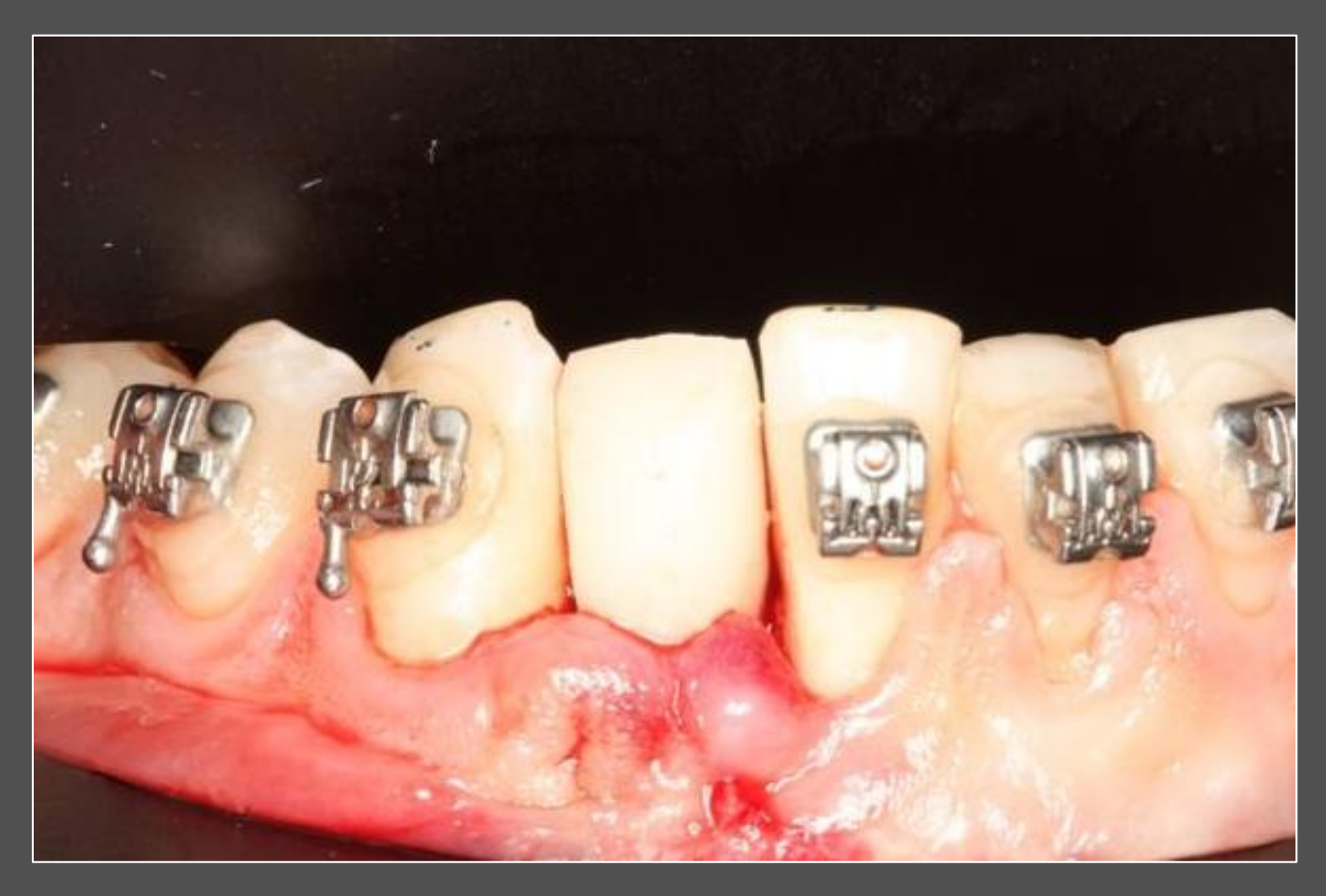
Temporary restoration on Immediate Temporary Abutment immediately after surgery.