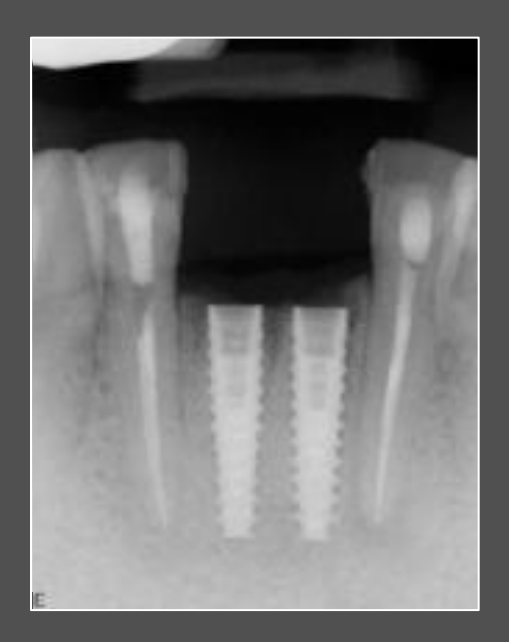
NobelActive 3.0 implants in place.