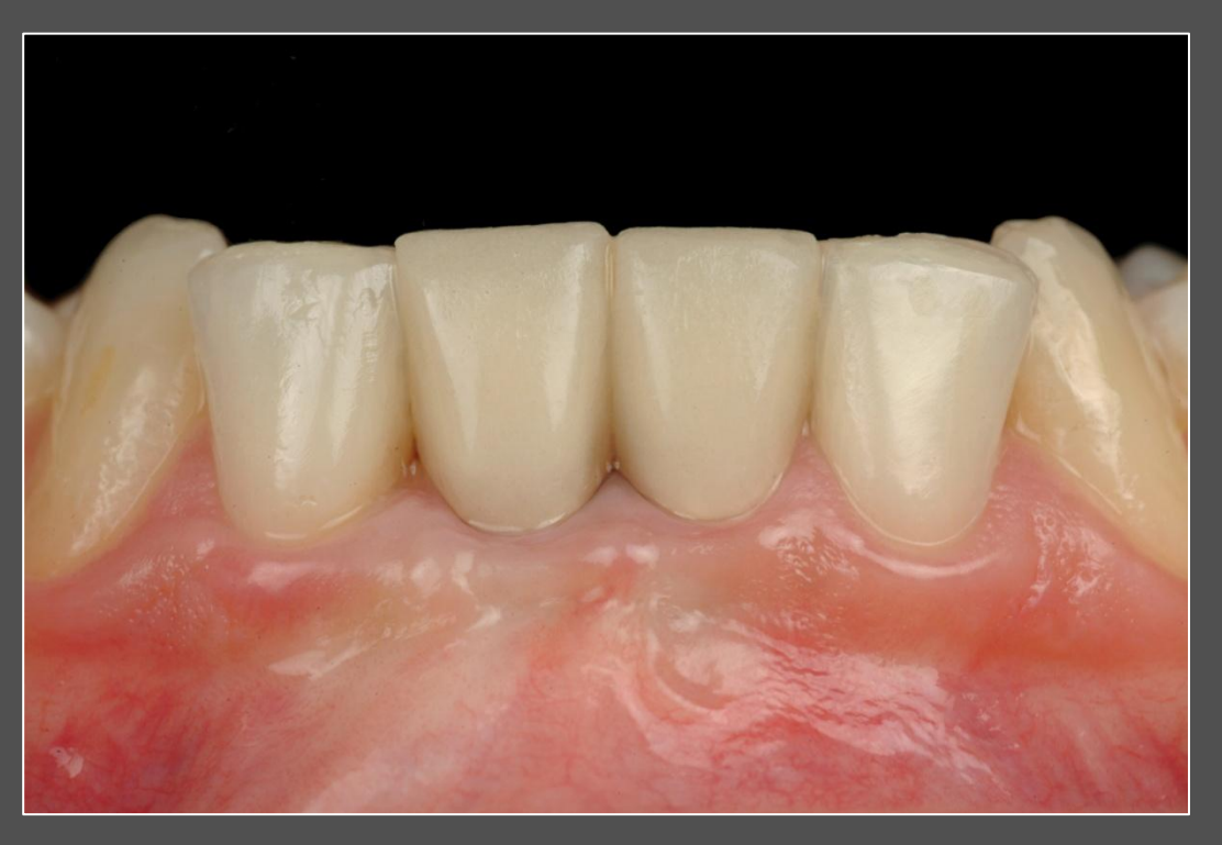
Development of an esthetic emergence profile three months after connective tissue graft maturation.