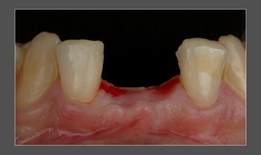
Initial clinical situation:

Extraction of both lower central incisors needed due to extensive root infection and fractured teeth. Highly limited space conditions.