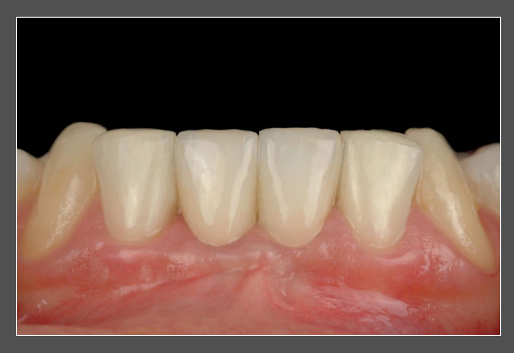
Two NobelProcera Zirconia Crowns cemented on NobelProcera Abutments seven months after surgery.